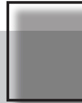
Position to be filled